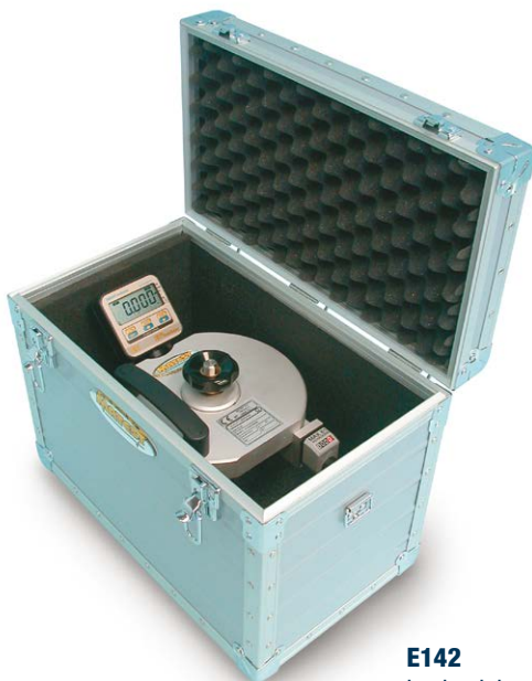
E142 in aluminium case