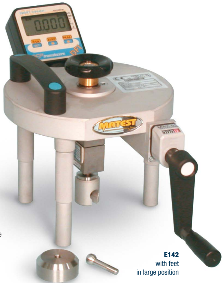
E142 with feet in large position

Identical to mod. E142 but with load cell and digital display range 0-5 kN for more accurate measurements on low strength values