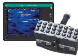
Pundit® PD8000 Basic