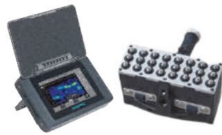
Pundit® 250 Array