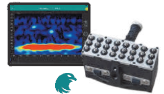
Pundit® PD8000 Pro