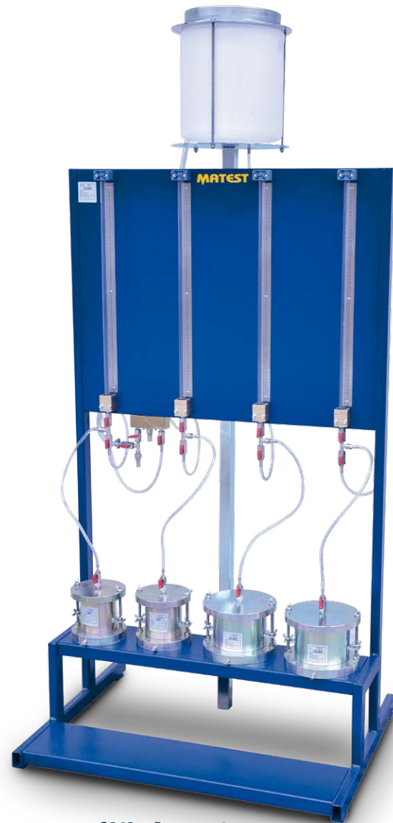
S248 + Permeameters

S253-02 MOULD BODY with two lateral water inlet/outlet for test with piezometric measurement